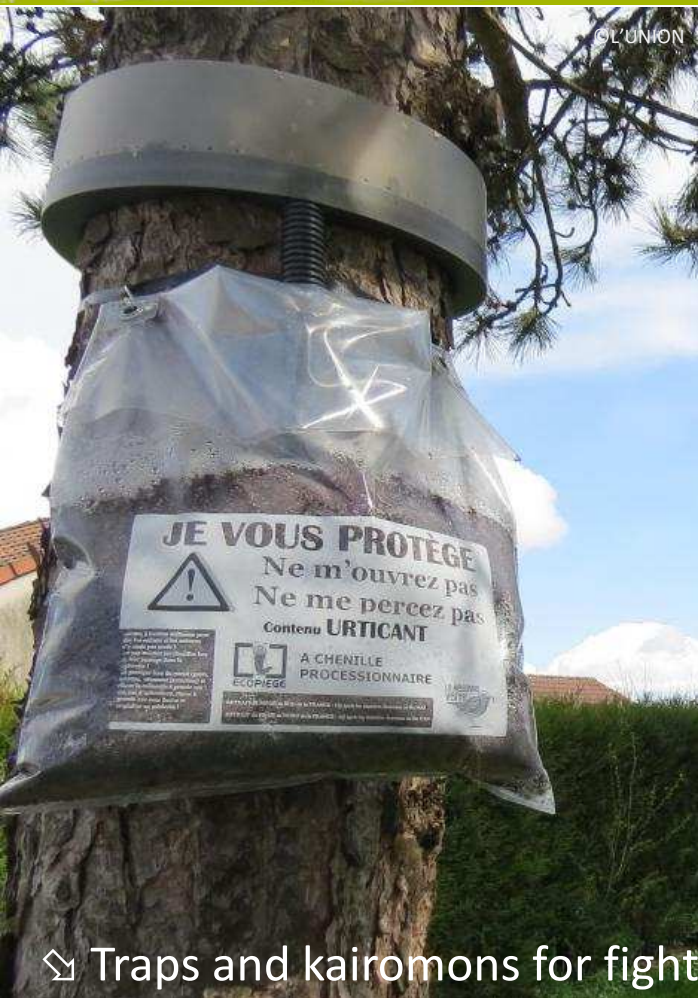
Traps and kairomons for fighting pine processionary caterpillar